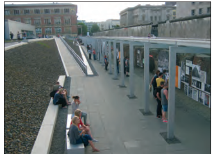
Checkpoint Charlie, left, and a fragment of the Berlin Wall above an outdoor historic timeline at the Topography of Terror museum.