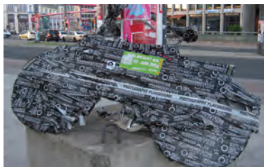
Whimsical sculptures are found across the city of Berlin.